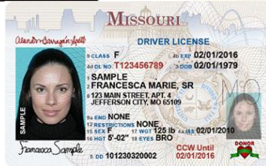
Missouri New Style Drivers License with CCW Endorsement.