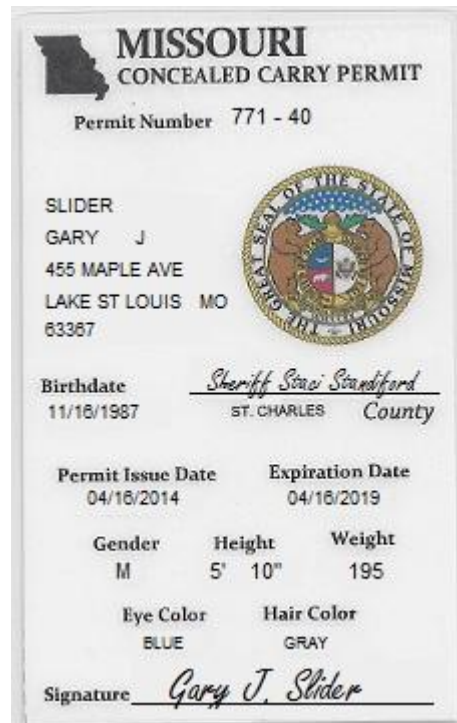
New Permit issued by Sheriff. Sheriffs took over issuing Permits in Missouri.